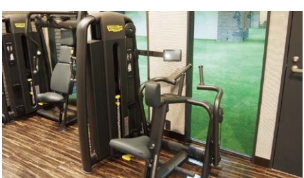
• Leg Press